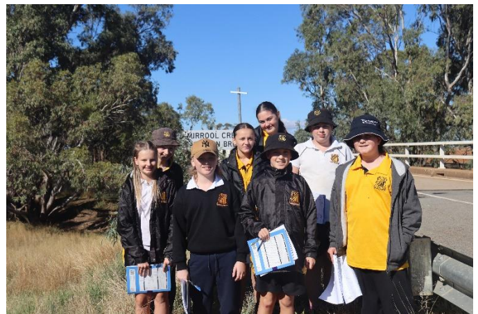
Year 7/8 Excursion