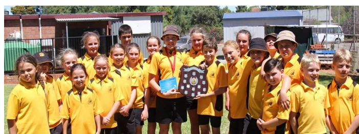
Our successful 2016 PSSA Swim Squad