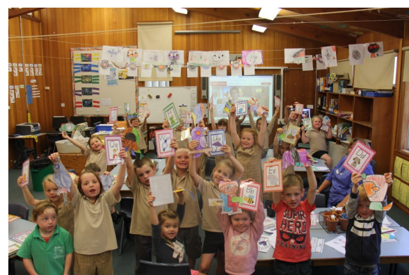
Lots of Learning