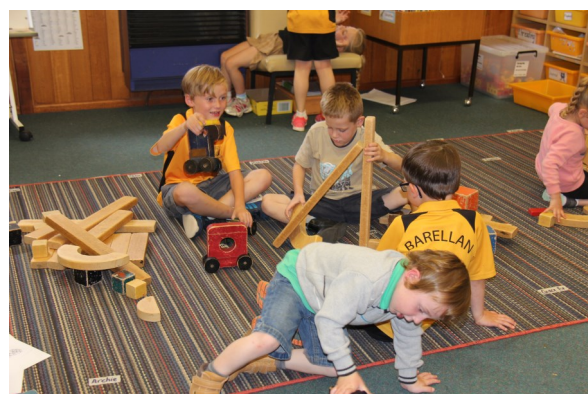
Learning through play