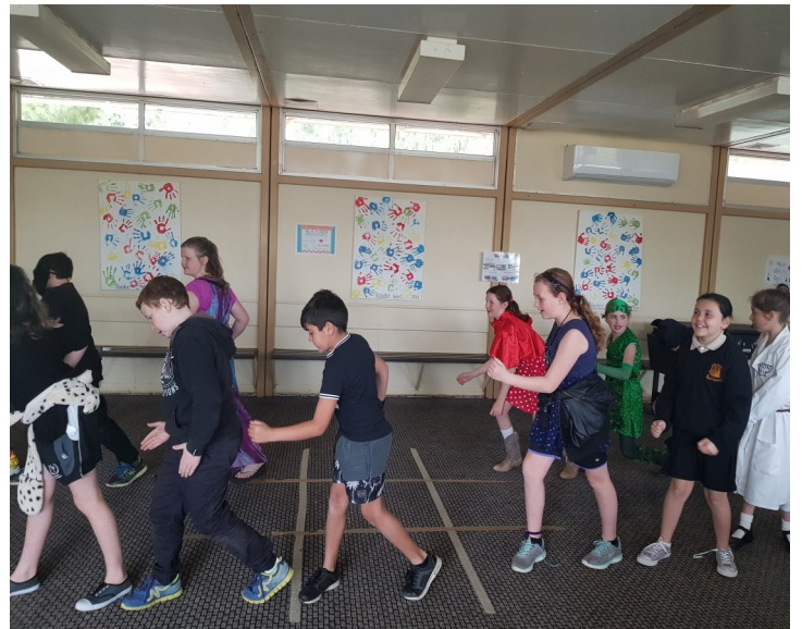
Variety Night practice

What a great way to wrap up Term 3 with Variety Night this Wednesday night. Please ensure your child has their costume ready and if possible, brought to school on Tuesday at the latest.