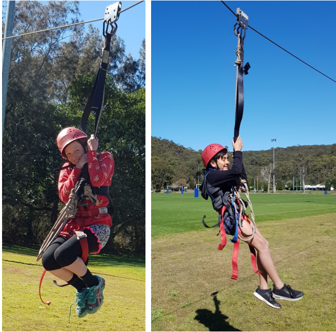
Having fun on the flying fox

4/5 have been incredibly busy these past few weeks with the major excursion to Sydney, lots of practice for our Variety Night item, the Book Week Parade and on top of that, some fantastic learning happening in the classroom.