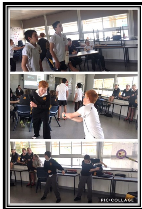
Year 7/8 boys rehearsing for their Variety Night item