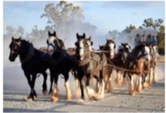
(On display at Pool)

Drawn Presentation night 15 th March 2018