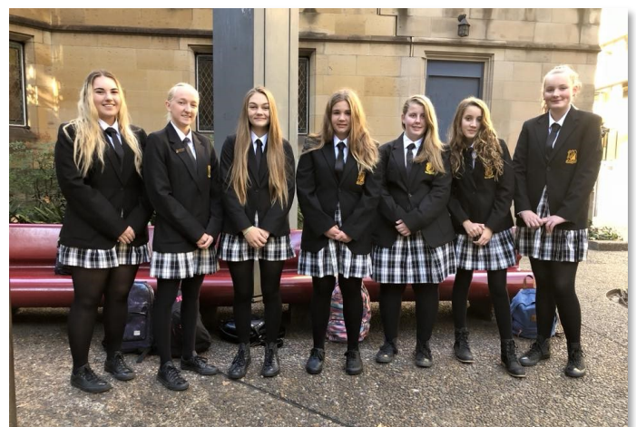
The choir ready to perform at Town Hall in Sydney.