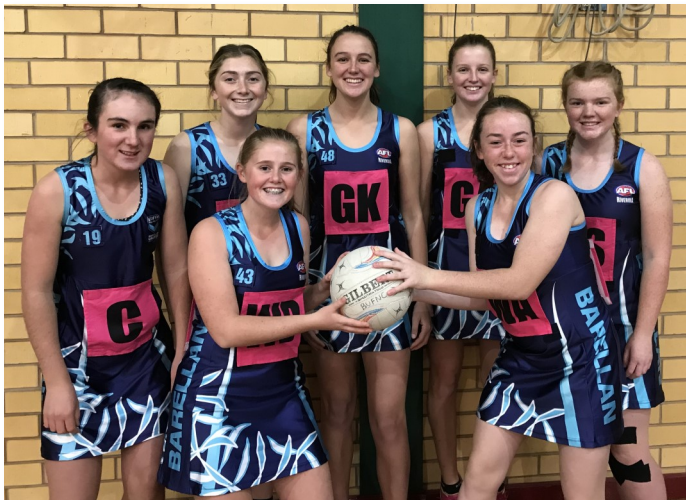
Under 16 CS Netball Team