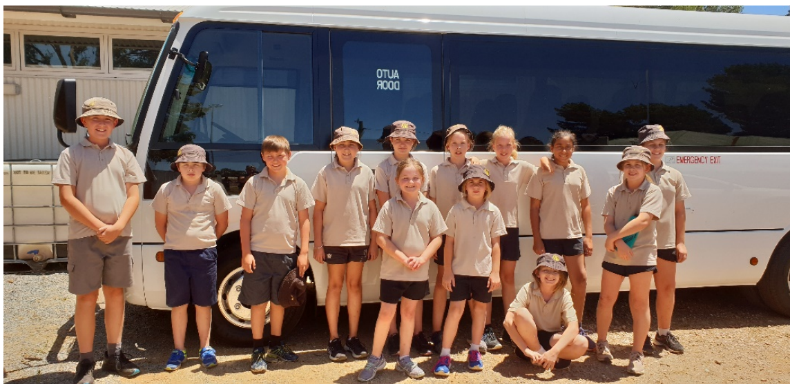
The B.C.S bus, which will be on the road in 2021.

Another P&C contribution to the learning and wellbeing of students and staff at Barellan Central School.