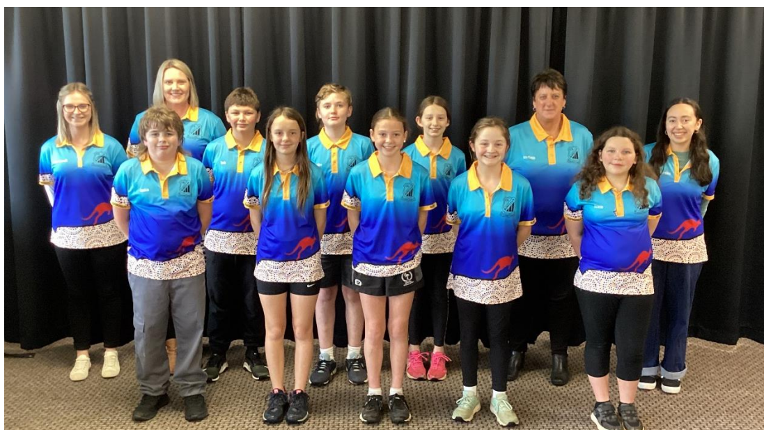
Year 6 - Class of 2022