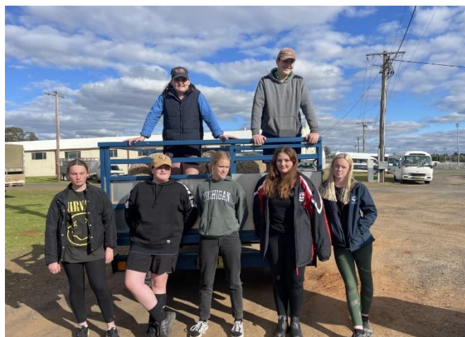
Yr 9/10 Ag Students at NSW Merino Wether Challenge