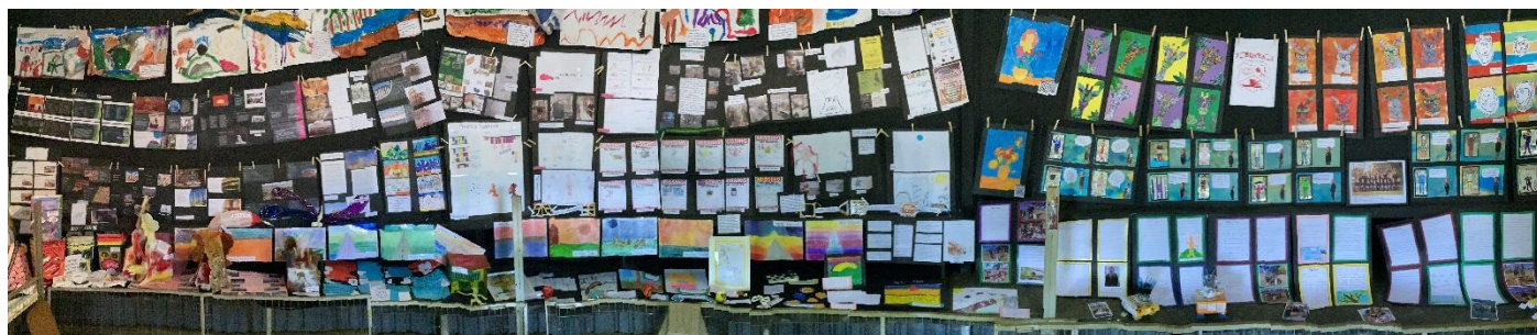
BCS display at the Barellan show

Facebook: https://www.facebook.com/nswdecbarellan