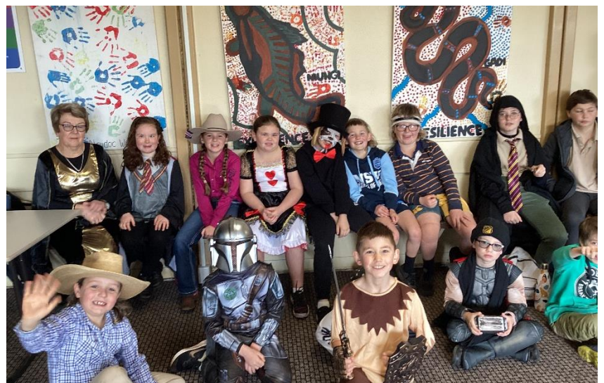
Ready for the parade to start