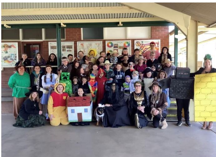
Students & Staff dress up for book week.