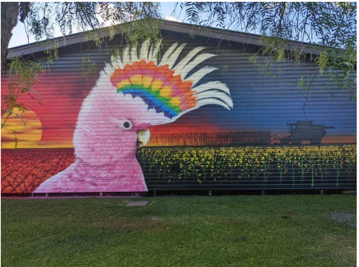
Barellan Central School Library Wall