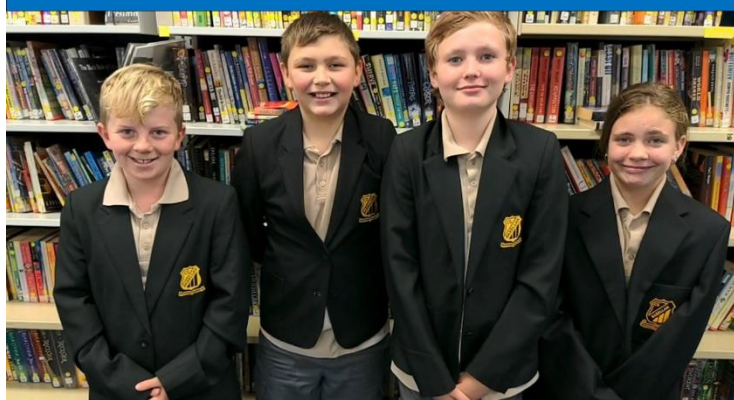
Barellan Central School Kangaroos