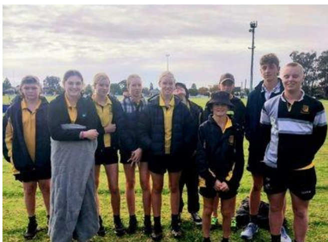
Barellan CHS Zone Athletics Representatives