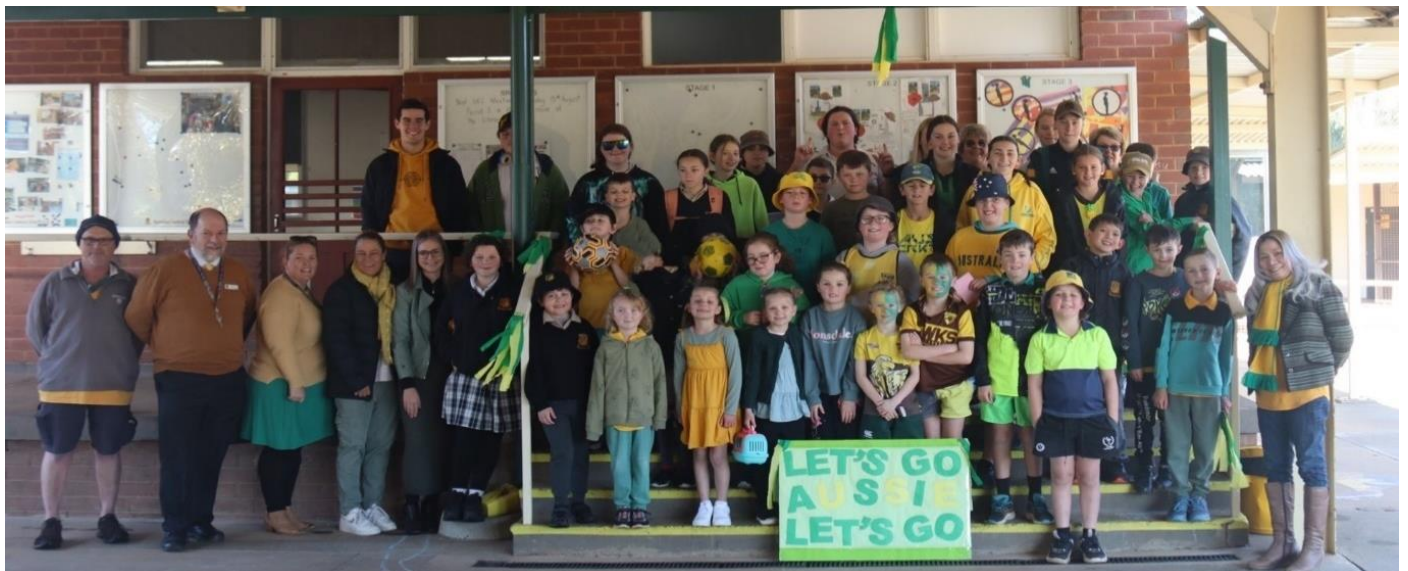
BCS goes Green and Gold for the day.