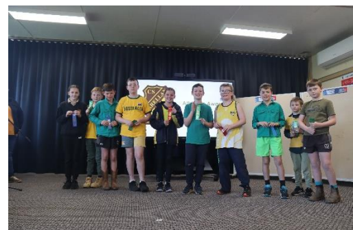
PSSA Zone Athletics Ribbon Recipients