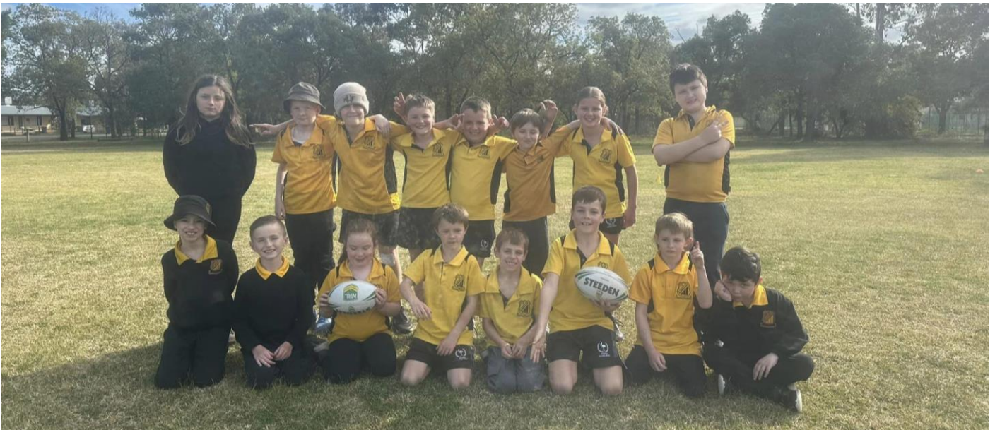
Rugby League Skills Day

Father's Day Breakfast and Footy Colour Day